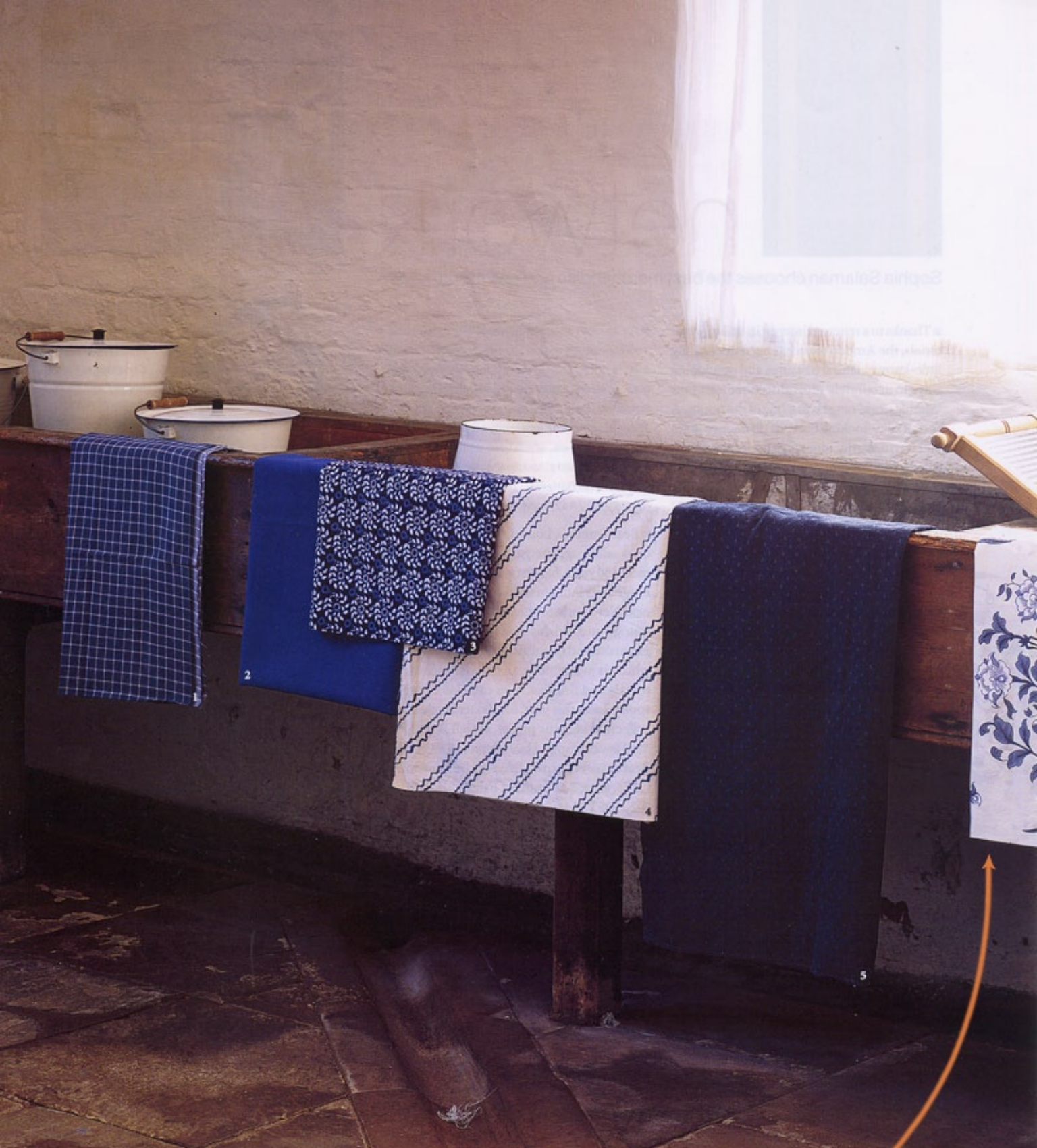
1 Indian cotton lungi, £18.62 approx, Caravane. 2 'Meadow Plain C7722-680', by Parkertex, £19.50, GP&J Baker. 3 Blue/white 'Batik Design 8', £11.50, Textile Traders. 4 Indigo 'Sabine 64', $110, Les Indiennes. 5 18th-century French indigo linen, £200 per 1.98 x 1.70m piece, Katherine Pole. 6 Indigo 'Peony', by Brigitte Singh, £48, Aleta. 7 French hand-blocked indigo linen, £49 approx, Blue Door. 8 'Wickham 7223-37', £21.50, Romo. 9 Indigo 'Shibori Pattern 005', £10, Slow Loris. Prices are per m, unless otherwise stated, and include VAT. For suppliers' details see Address Book >